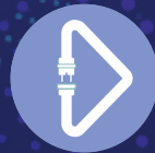
PLUG & PLAY